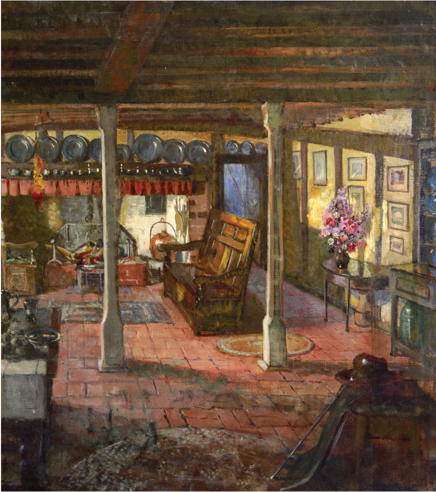
Figure 2.2. Clare Atwood, The Dining Room at Smallhythe , c. 1920. Oil on canvas, 550 x 495 mm. Smallhythe Place, Kent, UK. © Estate of Clare Atwood.

indirectness of love's visual expression by focusing less on narrative and more on the spaces of love. In doing this, they move us away from both a focus on desire and sexuality and the reductive model of high romance, offering instead a fuller and more nuanced notion of love as it might be lived. Implicit in my speculation will be thoughts about how art history might also mitigate the indirect expression of love, how historians might also challenge the romantic