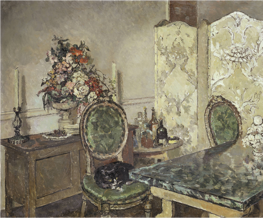
Figure 2.7. Clare Atwood, John Gielgud's Room , 1933. Oil on canvas, 635 x 764 mm. Tate Britain. © Estate of Clare Atwood.

taste of furniture with the green marble-topped table and Louis XIV chairs, and nineteenth-century boudoir screen, the drinks tray and cat curled up on a chair: all these remind us that a portrait of a room is the portrait of its inhabitant, and represents daily life, the use and care of possessions, the possibilities of social and emotional encounters, and so on. The painting also hints at the nexus of homosexuality, theatre and the decorative, a stereotypical set of connections, but connections that have been used positively and fruitfully by homosexual men to craft personal and professional lives, as was the case for Gielgud. In this painting, Atwood captures the porousness of home and inhabitant, of home and at-homeness. This is not a fantasy space promising an elsewhere, as in Solomon's vision and Aestheticist music room, but this is a space in which selfhood is firmly embedded.