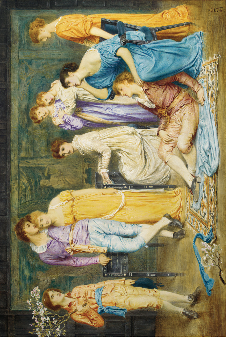
Figure 2.1. Simeon Solomon, A Prelude by Bach , 1868. Pencil, watercolour and bodycolour on paper, 432 x 650 mm. Private collection.