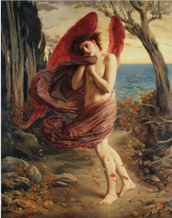
Figure 2.4. Simeon Solomon, Love in Autumn , 1866. Oil on canvas, 840 x 660 mm. Barbican Art Gallery, London, UK.

A Prelude by Bach (Figure 2.1), though, is perhaps the one work by Solomon that moves beyond the limitations of allegory and considers love in a more complex manner. Viewing the painting in light of May's conception of love, it seems to address the notion of ontological groundedness, of how love can provide a safe harbour for the self, an existential and literal home. For Solomon, though, this is done negatively; he depicts the absence of this for the homosexual man, not the grounding but the elusive promise of that grounding. The painting was originally exhibited as A Song of Spring at the Dudley Gallery in 1869; the title by which it is now known was added later. 6 The image represents a group of young people